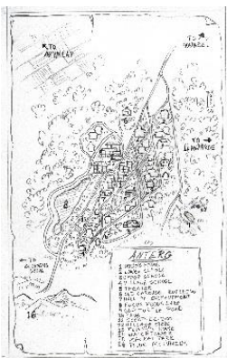
Map of Anterg

The Jigger Shop The Hall of Philosophy Governor Dick Tower Fish pond Conewago Lake Mt. Gretna Theater Tennis Court Gretna Heights Community Building Soldier's Field